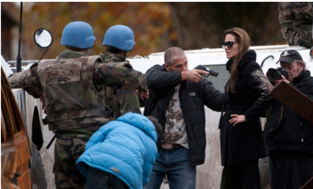
Parting shot... Angelina Jolie in Bosnia, on the set of her untitled directorial debut.

Angelina Jolie has cut short the filming of her directing debut in Bosnia after protests by war victims' groups.