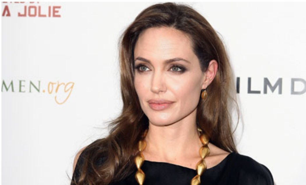
Angelina Jolie at the premiere of In the Land of Blood and Honey in New York.

Angelina Jolie has dismissed a lawsuit filed against her directing debut, In the Land of Blood and Honey , which claims it borrows liberally from a 2007 book by a Croatian journalist about the Balkan conflict of the early 1990s.