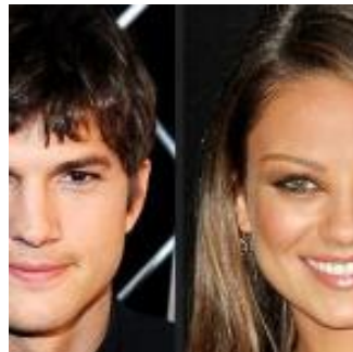
Ashton Kutcher and Mila Kunis: Going Public at Last?

Filed Under: Angelina Jolie , Celebrities , Celebrities Are Just Like Us , Celebrities Say The Darndest Things , Celebrity Moms , Featured Story , TV Tagged With: Angelina Jolie , vanity fair