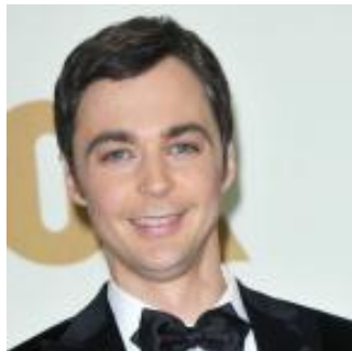
Big Bang Star Confirms: I'm Gay