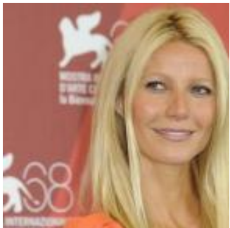
Gwyneth Paltrow Talks Adultery