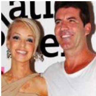
Simon Cowell Supports Katie Piper